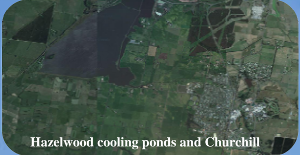
Hazelwood cooling ponds and Churchill

VFR Routes through R358 (East Sale Military Controlled Airspace) 1. Clearance required when R358 active 2. VFR Route 1 & 2 expect a clearance not above 1500FT 3. VFR Route 3 expect a clearance at 1500FT. Other levels may be available upon request.